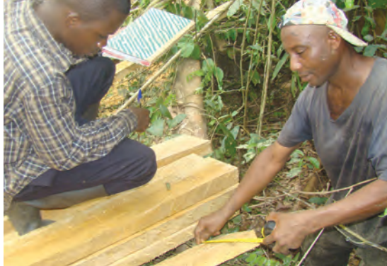
Implementing FLEG: Impacts on local people