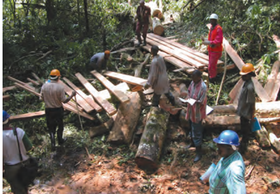
Implementing FLEGT: Impacts on local people

During the past decades much attention has been given to stimulate decentralization in the governance of forest resources. The principle of recognizing and stimulating a variety of forest management regimes has not yet been incorporated in the governance of timber trade. There exists a legal duality between the formally recognized timber sector and the informally tolerated artisanal timber sector.