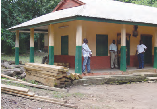
Implementing FLEGT: Impacts on local people

The EU has indicated that VPAs should have no undesirable negative impacts on indigenous people, forest-dependent communities or poor people. Achieving this requires the integration of precautionary social principles in the program. Several international organizations have identified the need to incorporate social safeguards at the earliest possible planning phase of a policy. This has not been the case in the FLEGT process.